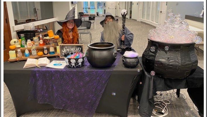
Our Fall Harvest and "Trunk" or Treat hosted by the Children's Ministry and M.U.M.S. (special needs) Ministry moved inside Fellowship Hall due to cold and rainy weather, but was still loads of fun!