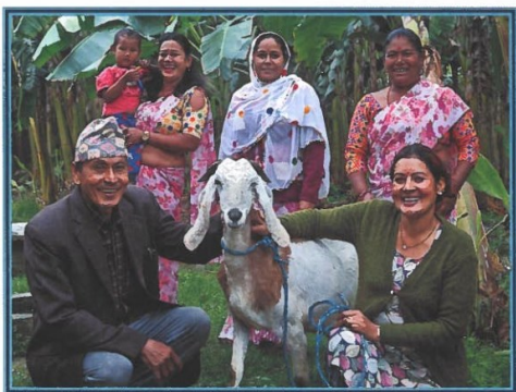
HEIFER INTERNATIONAL GRATEFULLY RECOGNIZES

Our goal as a church is to provide the gift of an Ark each year by raising at least $5,000. We have done it in the past, and with your help, we will do it again. (If you are curious, an Ark contains 2 cows, 2 sheep, 2 oxen, 2 water buffalo, 2 pigs, 2 beehives, 2 goats, a community veterinarian kit, 2 trios each of ducks, rabbits and guinea pigs, 2 flocks of geese and chickens, 2 llamas and 2 schools of fish.)