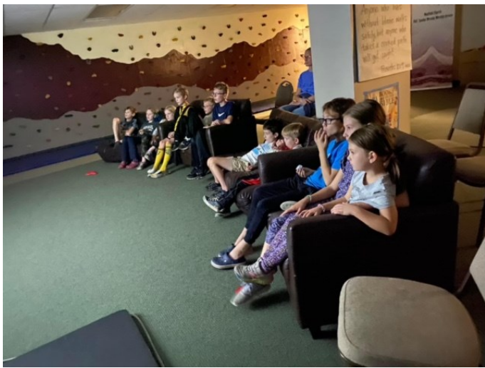
Tweens Ministry Dinner & Movie Night- Tweens in grades 4 and 5 attended the Free Community Dinner and watched the movie, "The Prince of Egypt"